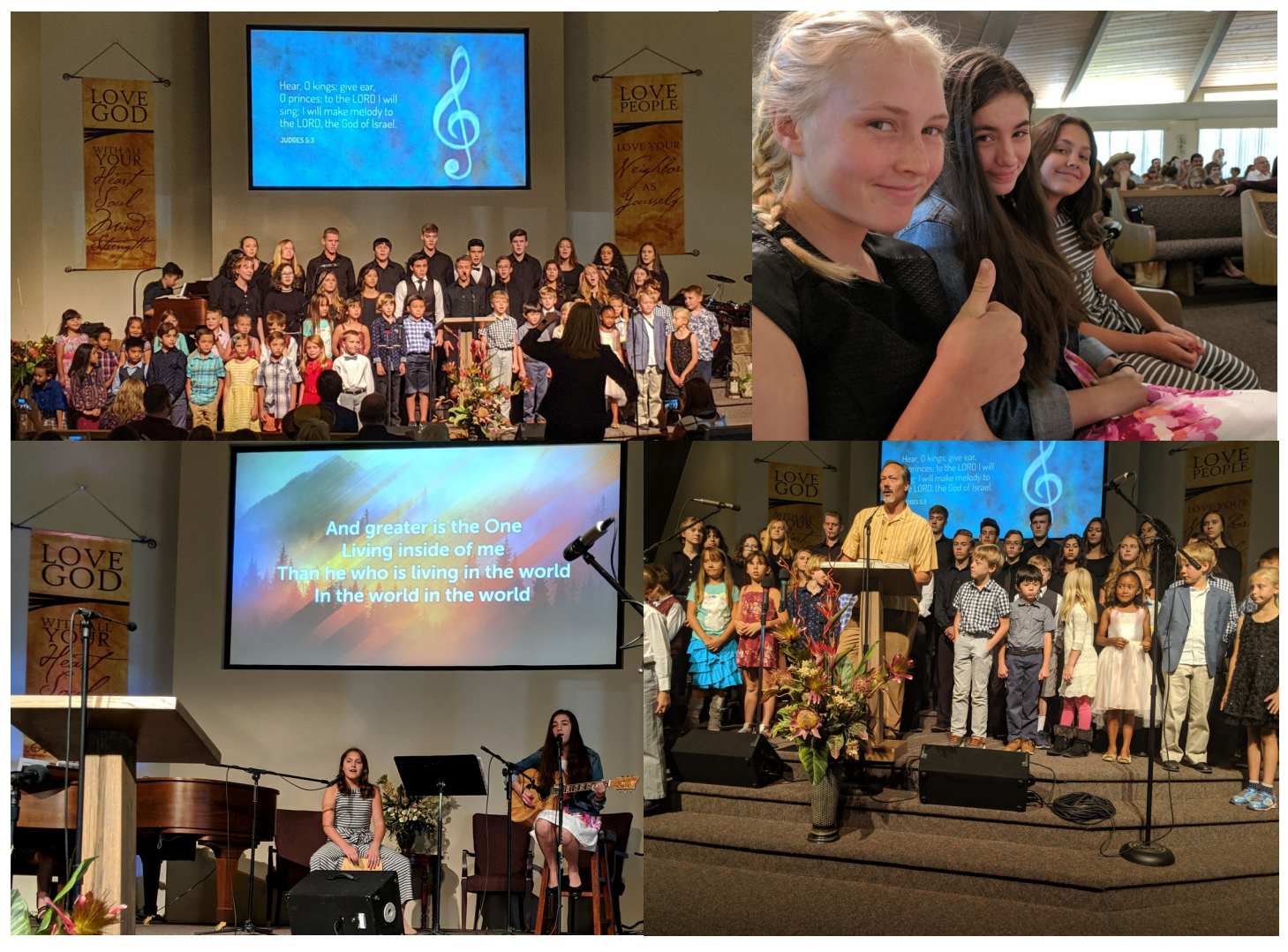
Pine Hills returns to Auburn on Oct. 26 with the high school choir and string group. We can't wait!