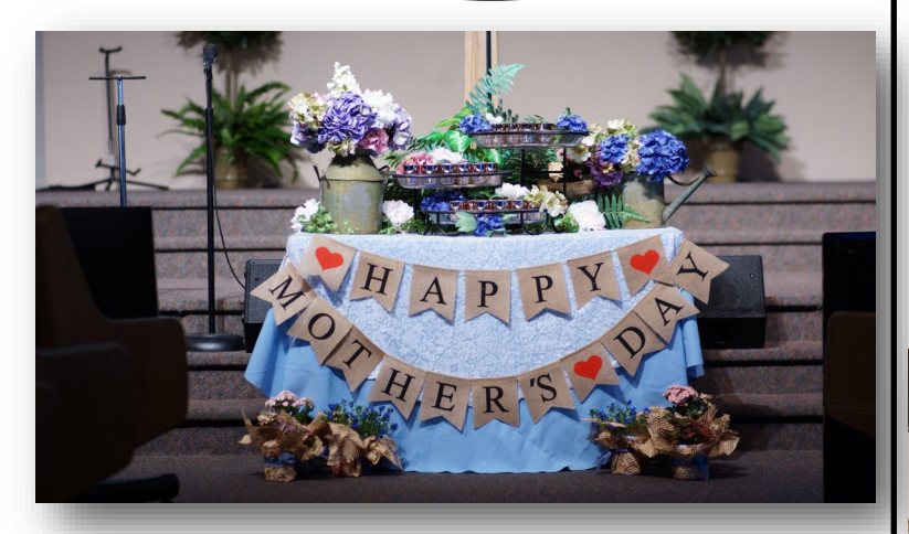
Mother's Day - May 13, 2023